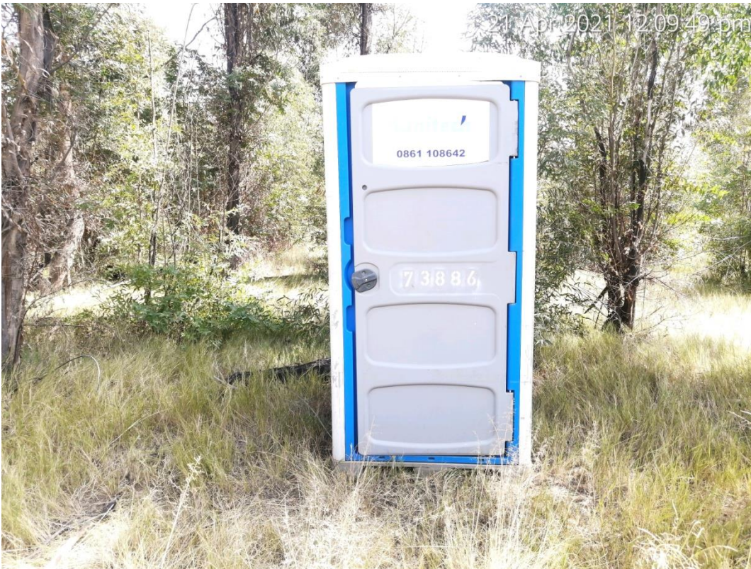
Figure 3: Ablution on site.