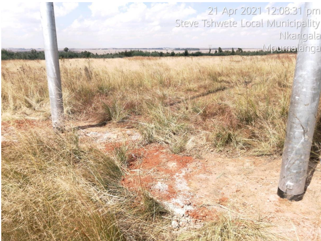
Figure 2: Base of structure.