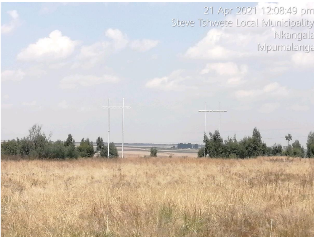
Figure 4: Structures inspected on the day of the audit.