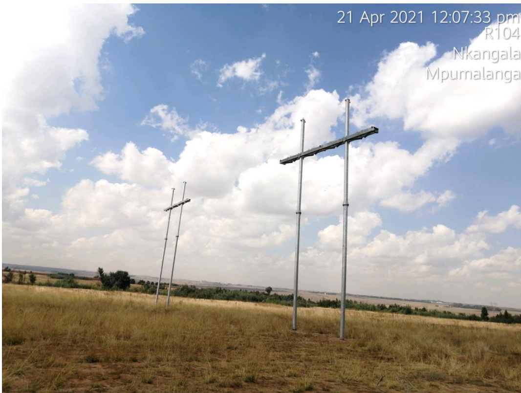
Figure 1: Structures inspected on the day of the audit.